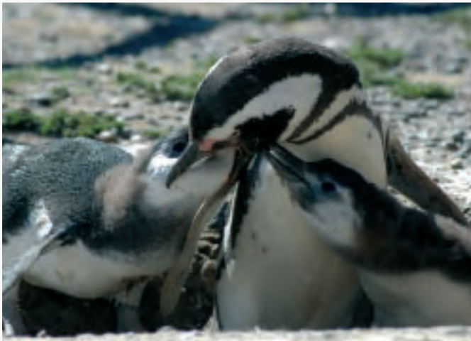
CHUBUT | PUERTO MADRYN | PENGUINS

Explore Valdés Peninsula, the largest in the Atlantic coast and home to the magnificent Southern Right Whale. Be amazed with its rich and varied wildlife from: elephants, seals, sea lions, penguins, armadillos, rheas, foxes, guanacos, hares, and admire it whilst hiking along the vast Patagonian landscape. Lodge on the peninsula, from where you may take hiking excursions to watch sea elephants. Visit an 'estancia' with wonderful views of the coast and the spectacular colony of Magellan penguins. The penguin's paradise can also be discovered through biking and by being in contact with the countryside. Watch them in Punta Tombo Penguin Reserve, the largest Magellan penguin colony in the Continent, home to over a million penguins during peak season.