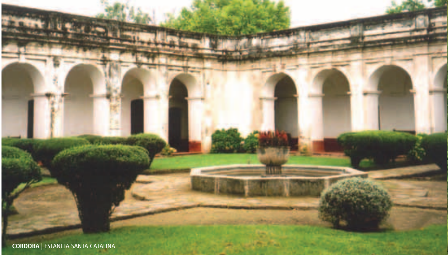
CORDOBA | ESTANCIA SANTA CATALINA