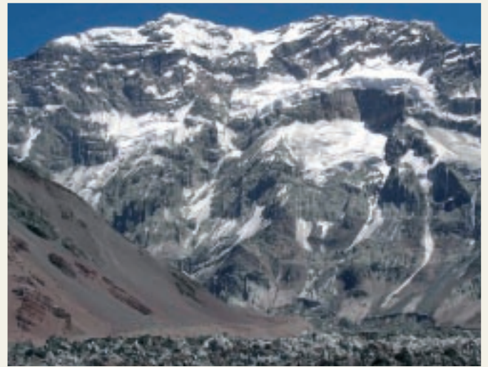
MENDOZA | MOUNT ACONCAGUA