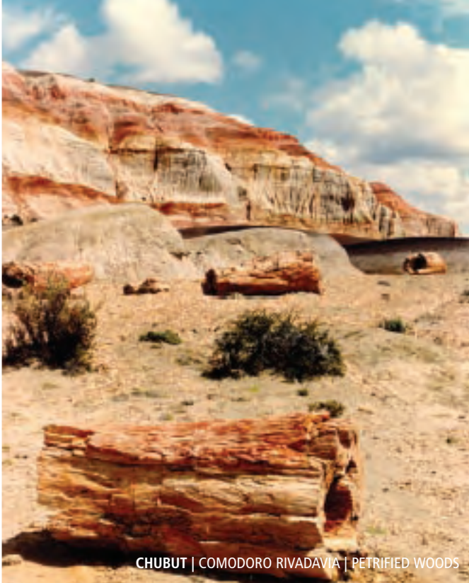
CHUBUT | COMODORO RIVADAVIA | PETRIFIED WOODS

The place where the past becomes present in the ancient woods, petrified by the action of volcanic eruptions which dust covered this land ages ago. You will be amazed by the wonderful scenery of the organized and complex social life of the Magellan penguins. The circuit includes a full day visit to Bahía Camarones and Cabo Dos Bahías reserves, two of the biggest rookeries in the country and where there are fewer traces of human presence.