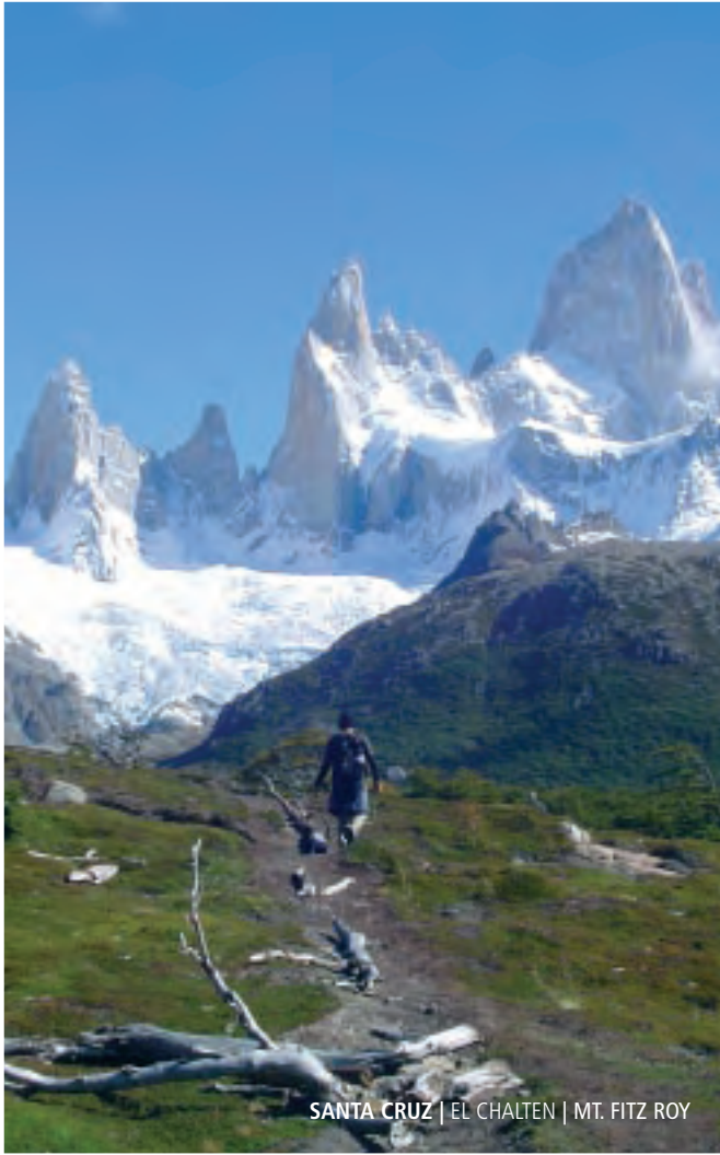
SANTA CRUZ | EL CHALTÉN | MT. FITZ ROY

SPANISH AND ENGLISH (English German Italian French)