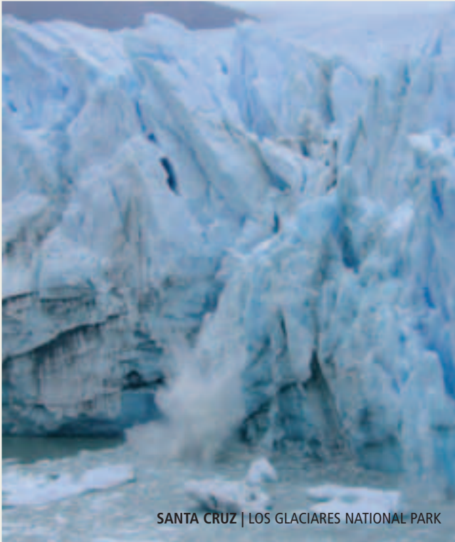
SANTA CRUZ | LOS GLACIARES NATIONAL PARK