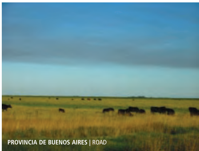
PROVINCIA DE BUENOS AIRES | ROAD