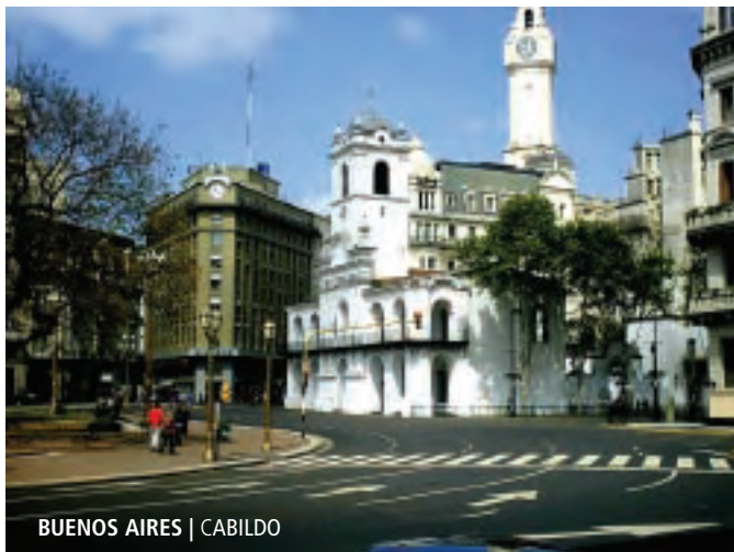
BUENOS AIRES | CABILDO