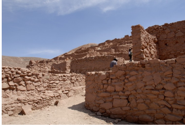
Pukara of Quito