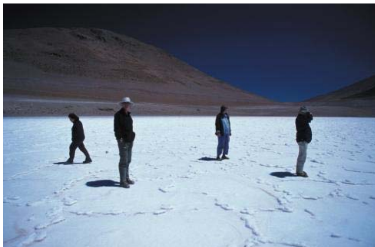
Atacama Salt Flat

Return to San Pedro around 18:00. Dinner not included.