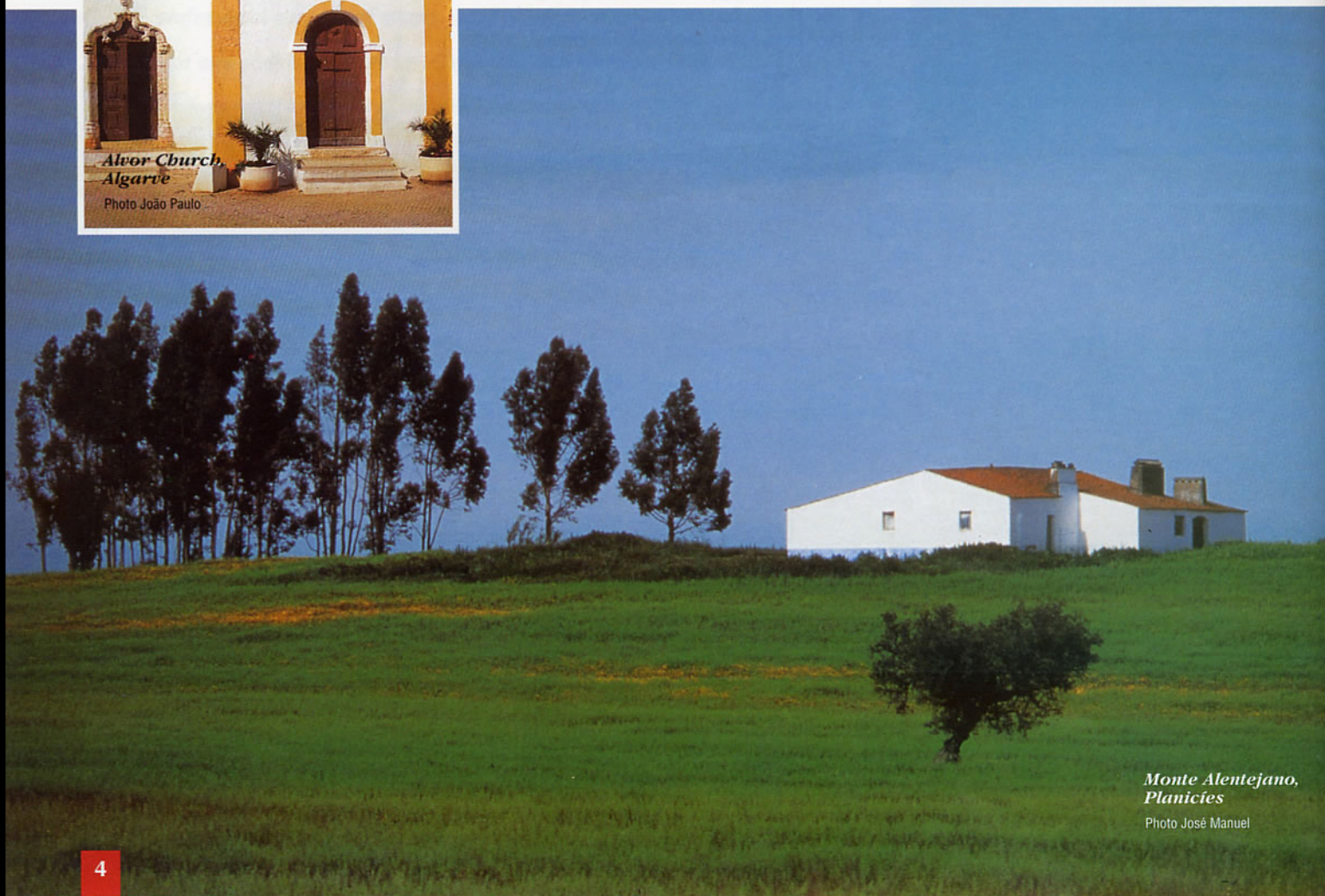
Monte Alentejano, Planicies

DAY 9 – Breakfast at hotel. Probably a short time for last minute shopping, then on to the airport for your return flight home. Transfer with assistance by private car.