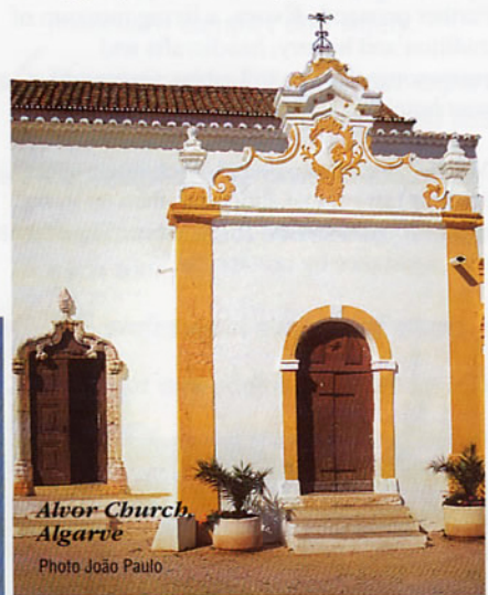
Alvor Church, Algarve

DAY 3 – After breakfast, morning half-day tour of Lisbon takes to many of its most historic and scenic sights. The remainder of the day and evening is at leisure to relax, take an optional tour (Sintra and Lisbon Coast) or shopping. In the evening, a visit to a