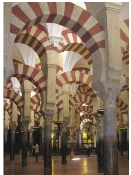
Cordoba. The Mezquita.