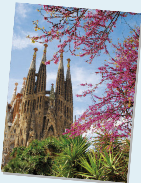
Barcelona. Sagrada Familia.